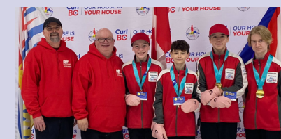
2024 BC Winter Games Champions - Boys Team Jaeger