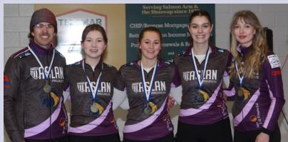
2024 BC U21 Womens' Champions Team Bowles