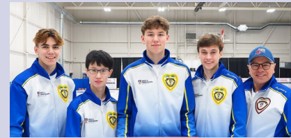
2024 BC U18 Boys' Champions Team Beck