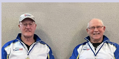
2024 BC Stick Champions Team Sears/Campbell