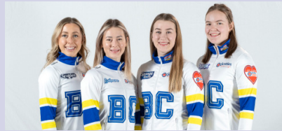
2024 BC Scotties Womens' Champions Team Grandy