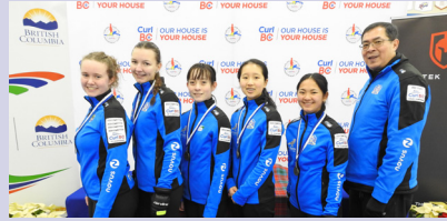
2024 BC U18 Girls' Champions Team Fitzgibbon