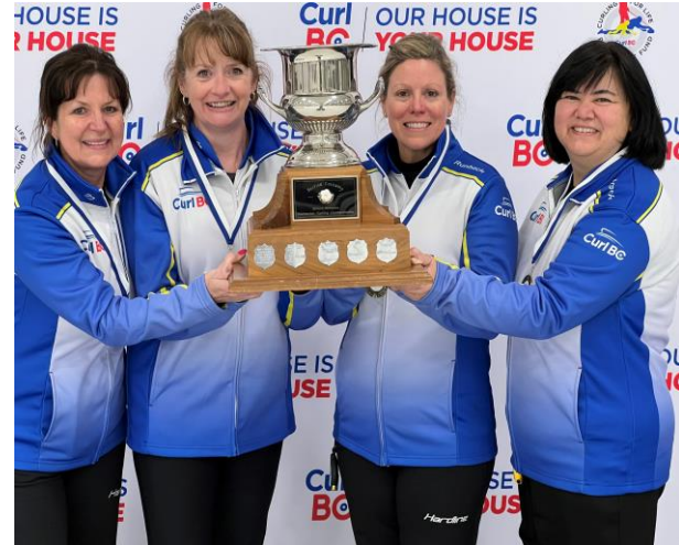
Recreational and Competitive Pathway