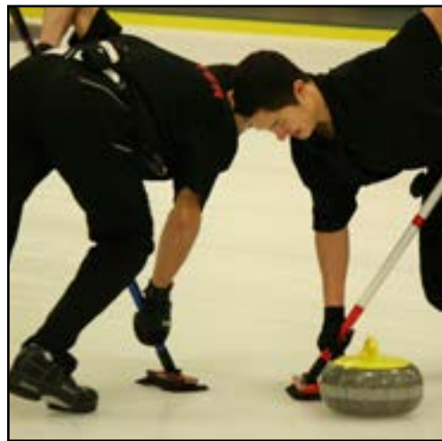
Junior curlers will be in the spotlight as their championship is the first Curl BC event to air on Sportsnet.

In October last year it was announced that Curl BC had signed a major 10-year agreement with Sportsnet.