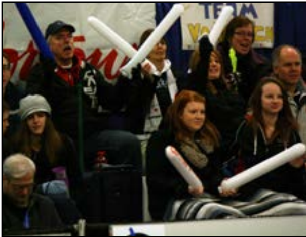
The crowd at the 2013 Tim Hortons BC Junior Curling Championships.

The women's junior final will air starting at 10:30am on December 31 and the men's junior final will air starting at 3pm on December 31.